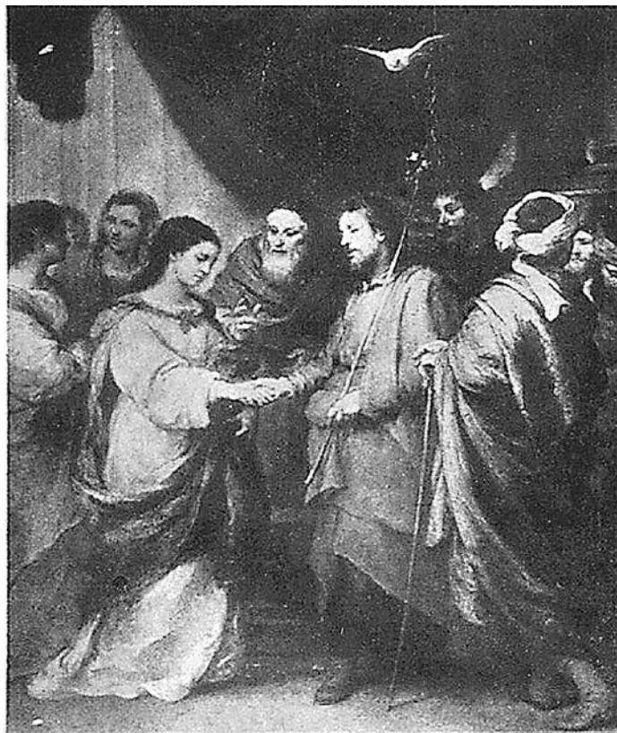
Espoused to St. Joseph, by Bartolomé Murillo, 1617-1682

Wind/Breath: This sign reminds us of the mystery of the Holy Spirit. We cannot ex-